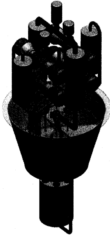
Figure 1. Reference FSPS layout

technologies are based on previous terrestrial and space experience, including the International Space Station (ISS). A potential layout of the reference FSPS (excluding radiator) is shown in Figure 1. An artist's rendition of the FSPS emplaced on the lunar surface is shown in Figure 2.