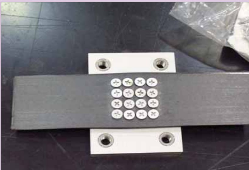
UNCURED COMPOSITE PLATE JOINED TO ALUMINUM PLATE WITH SCREWS

The method in its most basic form can be summarized as follows: A metal component is to be joined to a designated attachment area on a composite-material structure. In preparation for joining, the metal component is fabricated to include multiple “studs” projecting from the aforementioned face. Also in preparation for joining, holes just wide enough to accept the studs are molded into, drilled, or otherwise formed in the corresponding locations in the designated attachment area of the uncured (“wet”) composite structure. The metal component is brought together with the uncured composite structure so that the studs become firmly seated in the holes, thereby causing the composite material to become intertwined with the metal component in the joining area. Alternately, it is proposed to utilize other mechanical attachment schemes whereby the uncured composite and metallic parts are joined with “z-direction” fasteners. The resulting “wet” assembly is then subjected to the composite-curing heat treatment, becoming a unitary structure. It should be noted that this new art will require different techniques for CMC’s versus PMC’s, but the final architecture and companion curing philosophy is the same. For instance, a chemical vapor infiltration (CVI) fabrication technique may require special integration of the pre-form and