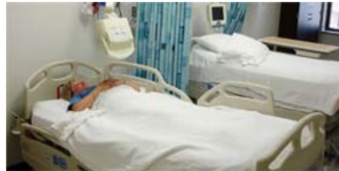
Bed rest subject at Flight Analog Research Center, General Clinical Research Center, UTMB