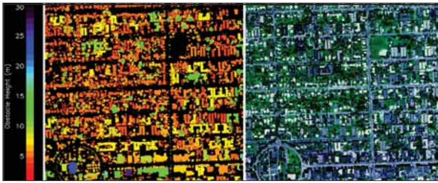
Processed Lidar Data (left) and Aerial Imagery (right) show a one-square-kilometer area of Broward County, Florida.

eters that are required to calculate the estimated surface roughness for a specified area. By using this algorithm, aerodynamic surface roughness values in urban areas can then be extracted automatically. The user can also adjust the algorithm for local conditions and lidar