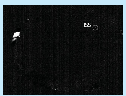
ALL-SKY IMAGE AFTER FRAME SUBTRACTION The ISS is clearly visible. The bright patch at the left is from trees moving in wind near light sources