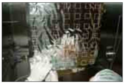
Figure 1. In this Prototype Assembly , a discrete matrix comprising a square array of square frames is placed on a metallized polymer film. In constructing a multilayer insulation blanket, arrays like this one would be placed between all the metallized polymer film layers.

The main difference between IMLI and conventional MLI lies in the method of maintaining the gaps between the film layers. In IMLI, the film layers are separated by what its developers call a micro-molded discrete matrix, which can be loosely characterized as consisting of arrays of highly engineered, small, lightweight, polymer (typically, thermoplastic) frames attached to, and placed between, the film layers (see Figure 1). The term "micro-molded" refers to both the smallness of the frames and the fact that they are fabricated in a process that forms precise