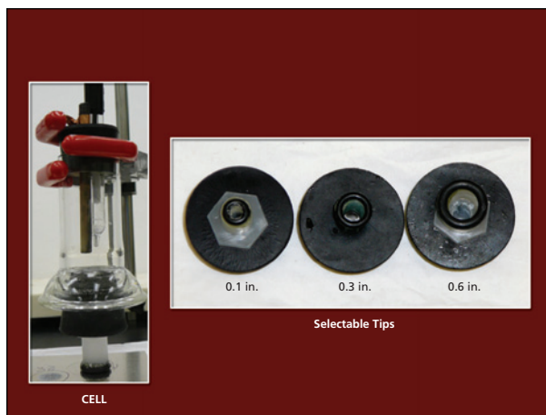
This Corrosion-Testing Electrochemical Cell is equipped with one of three selectable tips. Each tip features a different corrosion-pit diameter.

There are three selectable tips, having diameters of 0.1 in. (0.254 cm), 0.3 in. (0.762 cm), and 0.6 in. (1.524 cm), respec-