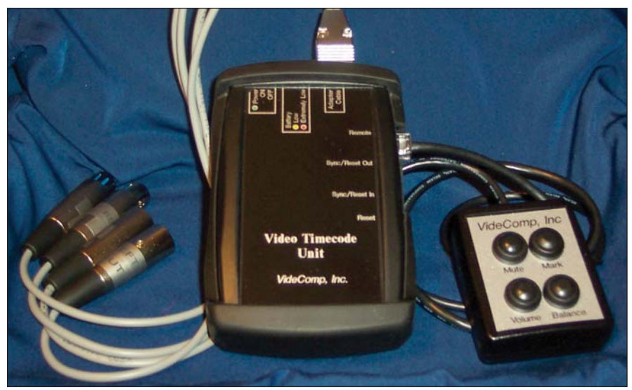
This Mockup of a VTU is based on a prototype VTU circuit powered by a standard 9-volt battery. To the extent possible, production VTUs would be made of low-power, precision electronic components that are already commercially available.

after 24 hours, the time code used in this system does not repeat for slightly more than 136 years; hence, this system is much better suited for long-term deployment of multiple cameras.