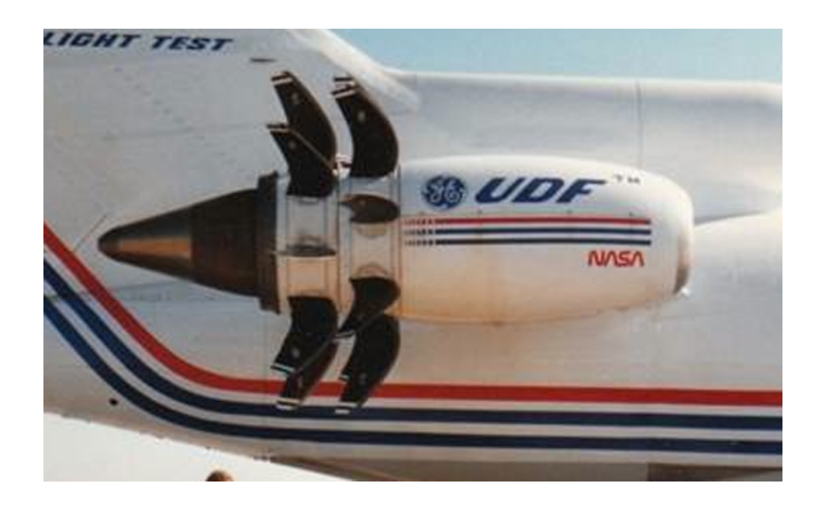
Figure 1- An example of contra-rotating open rotor design by GE

The high fuel prices of recent years have caused the operating cost of the airlines to soar. In an effort to bring down the fuel consumption, the major aircraft engine manufacturers such as GE, Rolls-Royce and CFM International are now taking a fresh look at open rotors for the propulsion of future airliners. Open rotors, also known as propfans or unducted fans, can offer up to 30 per cent improvement in efficiency compared to high bypass engines of 1980 vintage currently in use in most civilian aircraft. The lower fuel consumption of open rotors also contributes to the reduction of carbon emission into the atmosphere by airliners. Open rotor propulsion system can, therefore, be considered a Green engine. The single and contra-rotating open rotors are both under consideration for powering future aircraft. An example of a contra-rotating open rotor is shown in Figure 1 below.