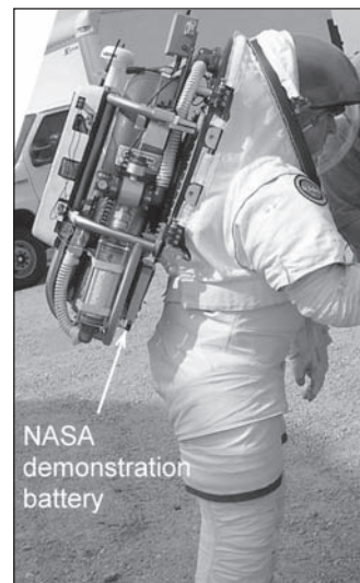
NASA Desert RATS battery installed on a spacesuit LAB.

Demonstration batteries used four lightweight, 4.5-A-hr pouch cells, connected in series. The pouch cells, manufactured by Quallion LLC, were based on a product developed for the U.S. Army's Communications-Electronics Research, Development and Engineering Center under