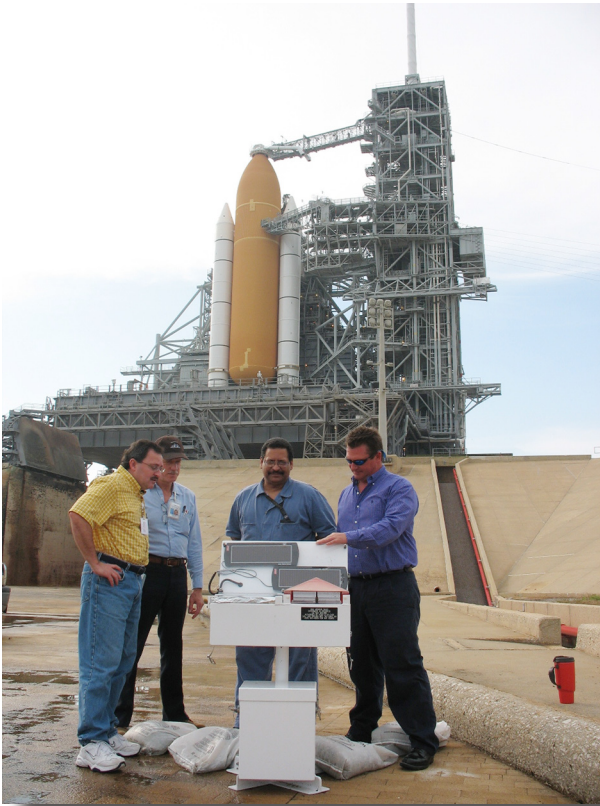
Hail monitor station 3 (HM-3) at Launch Pad 39A.

inspection of the vehicle immediately following a storm. During one week while Endeavour was on the pad, numerous hail storms occurred all around KSC. The HMA showed no detections, indicating that the Shuttle had not been damaged by hail at any time during those frequent local hail storms.