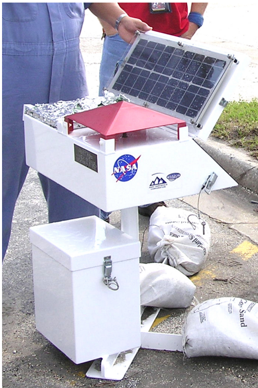
HM-2 after the February 26, 2007, severe hail event at Launch Pad 39A.