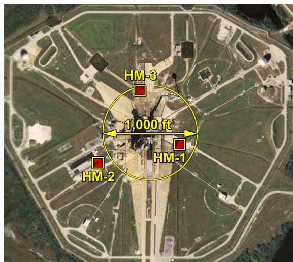
Location of hail monitor stations, HM-1, HM-2, and HM-3, at Launch Pad 39A.

The HMA system consists of three stations approximately 500 ft from the launch pad. The hail monitor sensor is basically a metal plate in the shape of a shallow pyramid. It deflects hail from the sensor surface after one hit, thus preventing multiple bounces from the same hail stone. A microphone pickup is mounted beneath the center of the metal plate. The output of this microphone is connected to an electronic circuit that digitizes and processes the microphone signal and then transmits a trigger pulse to one of six output channels. Each output channel represents a signal that is twice as large as the previous channel, thereby categorizing the hail stone into one of six sizes, from diameters of about 10 to 20 mm, in 2-mm steps. The six output channels are connected to six liquid-crystal diode (LCD) counters, which create a permanent record of all hail hitting the sensor. The counters are manually reset after a hail storm.