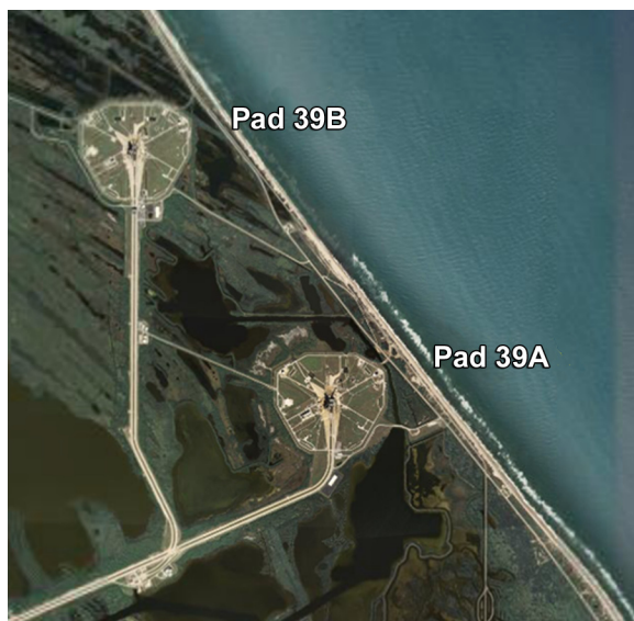
Shuttle Launch Pads 39A and 39B.

In response, the hail monitor array (HMA) system, a joint effort of the Applied Physics Laboratory operated by NASA and ASRC Aerospace at KSC, was deployed for operational testing in the fall of 2006. Volunteers from the Community Collaborative Rain, Hail, and Snow (CoCoRaHS) network, in conjunction with Colorado State University, continue to test duplicate hail monitor systems deployed in the high plains of Colorado.