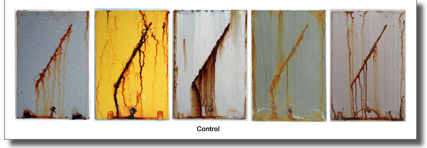
Figure 2. After 1,000 hours of salt fog exposure, all of the coatings showed degradation.