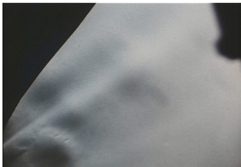
Figure 1. Example view taken during descent of Apollo lander. The dust is eroding from the lower left to the upper right.

The instrument can also measure other lunar surface dust effects, such as dust levitated by solar charging. Though most of the effort for the current instrument has been focused toward lunar applications, the instrument is quite general and could easily be adapted to other applications such as Martian landings.