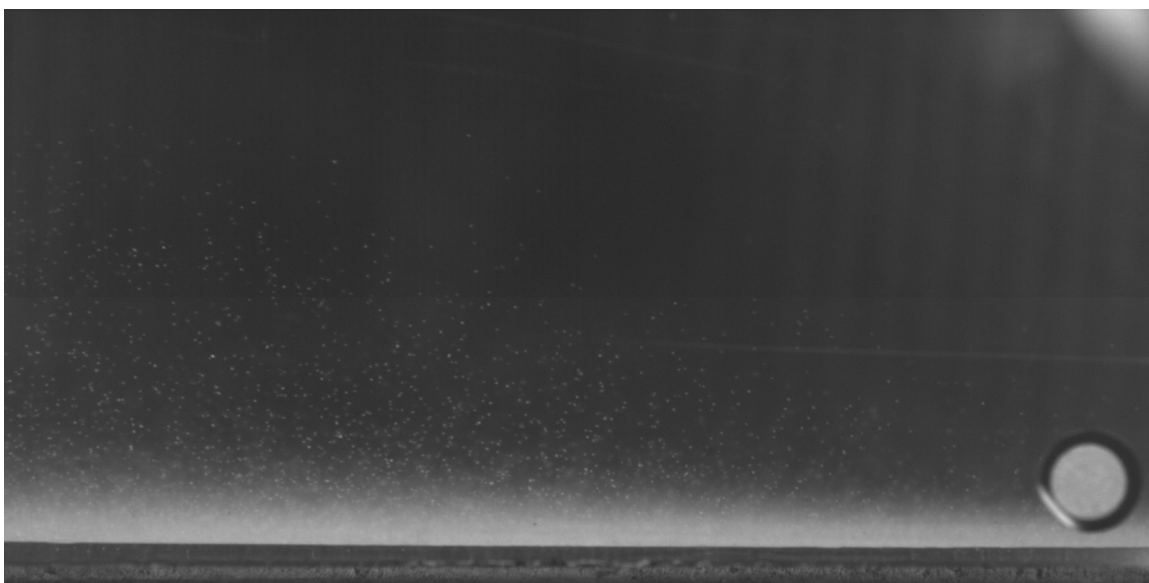
Figure 2. Quartz sand flowing in the wind tunnel used to test the PELT instrumentation designs.