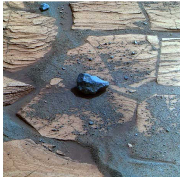
Figure 1. Pancam false color image of Santorini (Sol1713B_P2588_1_False_L257). The upper surface shows a relatively high reflectance.

Pancam: Santorini and its angular features are shown in the Pancam image in Figure 1. The cobble measures approximately 6 by 8 cm. The top of the rock shows a relatively high reflectance, maybe as a result of wind-polishing. Pancam spectra show a broad downturn towards 1009 nm consistently across its surface. Santa Catarina is part of an extended cobble field which showed two different spectral types: One with a broad NIR absorption with an apparent band minimum