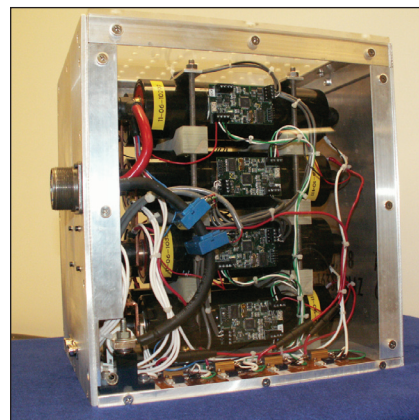
A prototype of the 28-V, 60-A-h Lithium Ion Battery.

The solution to the single-fault failure, due to the use of a single charge controller (CC), was solved by implementing one CC per cell and linking