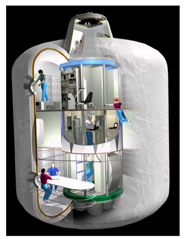
Figure 1: TransHab Inflatable Module

The TransHab project developed an experimental inflatable module at Johnson Space Center in the 1990's. The TransHab design was originally envisioned for use in Mars Transits but was also studied as a potential habitat for the International Space Station (ISS).