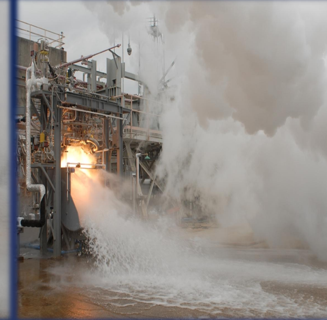
J-2X Workhorse Gas Generator Firing