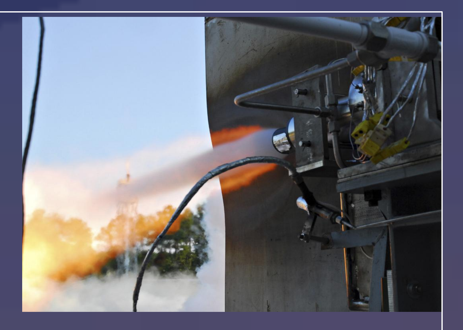
Engineers at the Marshall Center conduct a battery of tests on the J-2X's workhorse gas generator, the driver for the turbopumps which start the engine for the Ares I rocket upper stage.

During my time here at the Marshall Space Flight Center (MSFC), I have learned how to use the ProEngineering (ProE) design software. I have used it to model small components of the test configurations being used for the J-2X Workhorse Gas Generator Testing Phase IIc.