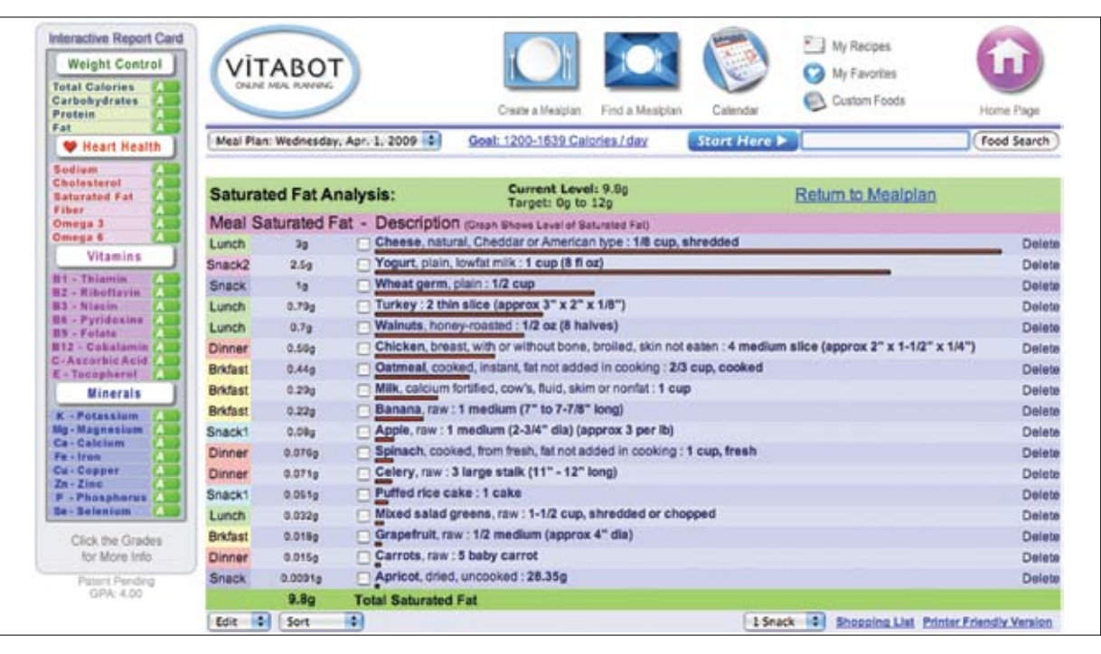
Vitabot uses robotics algorithms to help users take advantage of vast amounts of detailed nutritional data and develop balanced meal plans.

"Vitabot uses the exact same style of algorithms that we developed between the robot and the operator," says Graves. The result is an easy-to-use online program that allows users to set health goals like desired weight and then plan balanced meals using a food database featuring tens of thousands of choices. Available through corporate wellness programs and health clubs, Vitabot centers around an interactive report card that grades how food choices measure up to users' nutritional needs in a wide range of categories including calories, fat, electrolytes, minerals, and vitamins. Users can build complete menus of favorite foods that also match their nutritional needs, allowing them to make real, individually tailored use of the previously overwhelming quantities of available nutritional data. Vitabot's algorithms guide the users' choices