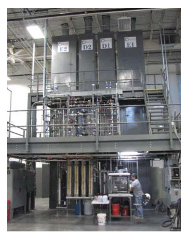
By increasing the size of its fluidized bed reactors, seen here, SouthWest NanoTechnologies Inc. (SWeNT) increased its carbon nanotube production capacity while at the same time lowering cost.

In order to reduce spacecraft weight without sacrificing structural integrity, NASA is pursuing the development of materials that promise to revolutionize not only spacecraft construction, but also a host of potential applications on Earth. Single-walled carbon nanotubes are one material of particular interest. These tubular, single-layer carbon molecules-100,000 of them braided together would be no thicker than a human hair-display a range of remarkable characteristics. Possessing greater tensile strength than steel at a fraction of the weight, the nanotubes are efficient heat conductors with metallic or semiconductor electrical properties depending on their diameter and chirality (the pattern of each nanotube's hexagonal lattice structure). All of these properties make the nanotubes an appealing material for spacecraft construction, with the potential for nanotube composites to reduce spacecraft weight by 50 percent or more. The nanotubes may also feature in a number of other space exploration applications, including life support, energy storage, and sensor technologies.