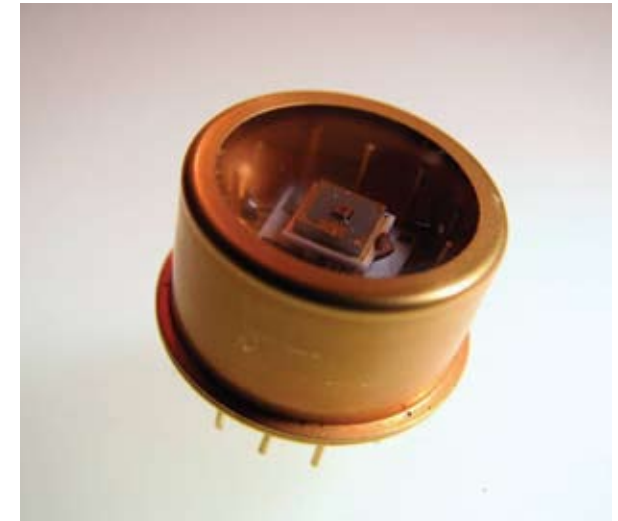
Amplification Technologies's NIRDAPD photomultiplier can sense infrared light down to individual photons, without the cooling required by other infrared sensors.

“This device can be applied for any NIR optical sensing that requires single photon detection,” says Linga, citing communications, the military, and imaging as main markets for the sensor. The NIRDAPD photomultiplier can be used for free space optical communications applications closer to Earth, like satellite communications and data transmission from unmanned aerial vehicles used for military purposes or forest fire detection. Additional military applications include lidar and ladar range-finding