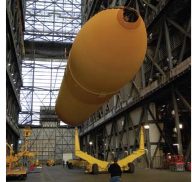
The retractable pin tool developed at Marshall Space Flight Center fully enables friction stir welding (FSW) for circumferential and tapered thickness welds, like those needed to assemble the space shuttle's external tank.

In the late 1990s, Nova-Tech Engineering LLC, a machine design, aerospace tooling, and manufacturing