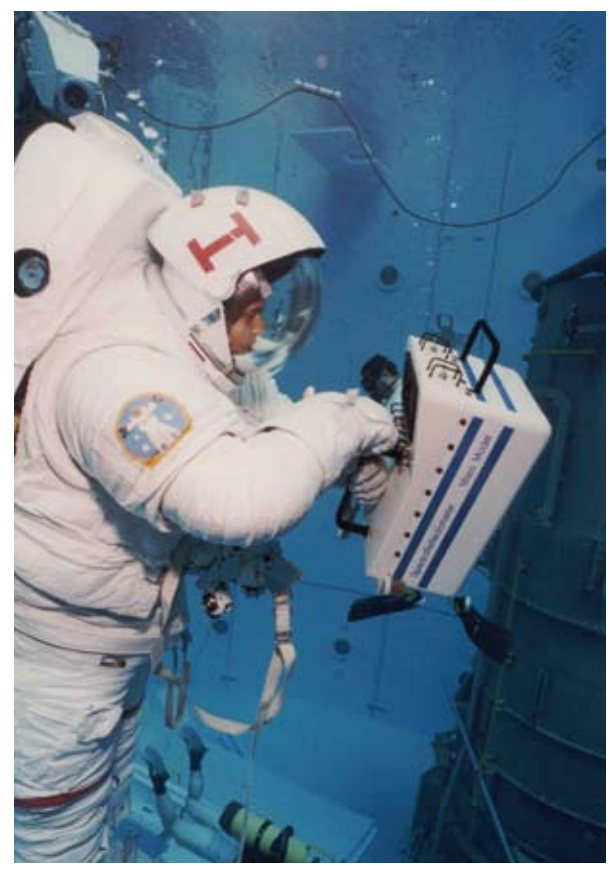
During training exercies, an astronaut uses a mockup of a space-portable spectral reflectometer, an instrument for measuring the thermal properties of surfaces in space.

Marshall awarded AZ Technology its first NASA contract in 1989 to develop a space-portable spectral reflectometer (SPSR), a hand-held instrument for measuring the thermal properties of surfaces in space. The SPSR was transported to the Mir space station on STS-86, and then used in EVAs to assess the optical performance of external spacecraft radiation tiles.