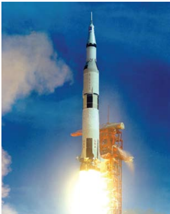
The Saturn V was a liquid-fueled expendable rocket used for Apollo and Skylab missions. Apollo 15, shown here, used over three-quarters of a million gallons of liquid oxygen and liquid hydrogen.

R ocket fuel needs to stay cool—super cool, in fact. The ability to store gas propellants like liquid hydrogen and oxygen at cryogenic temperatures (below -243^{\circ}\text{F} ) is crucial for space missions in order to reduce their volumes and allow their storage in smaller (and therefore, less costly) tanks. The Agency has used these cryogenic fluids for vehicle propellants, reactants, and life support systems since 1962 with the Centaur upper stage rocket, which was powered with liquid oxygen and liquid hydrogen.