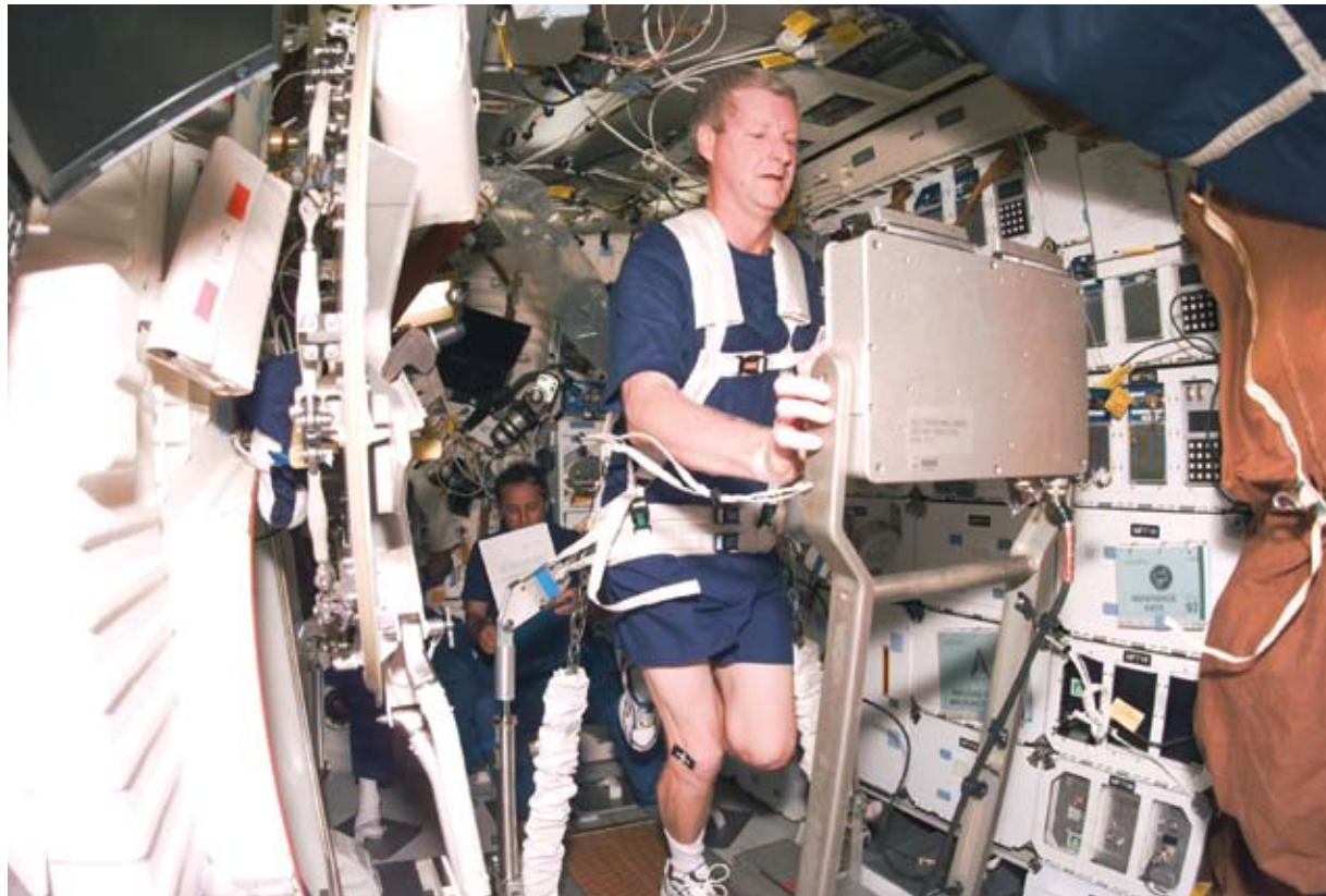
Vigorous exercise while in space is one measure astronauts can take, along with hydration efforts, to help mitigate difficulties adjusting to Earth's gravity upon return from long-term missions.

In early 2009, Boulder, Colorado-based Wellness Brands Inc. exclusively licensed the concentrated elec-