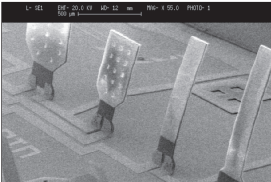
Figure 1. Artificial-Hair-Cell Flow Sensors shown in this scanning electron micrograph have several different widths as well as different heights ranging from 0.6 to 1.5 mm.