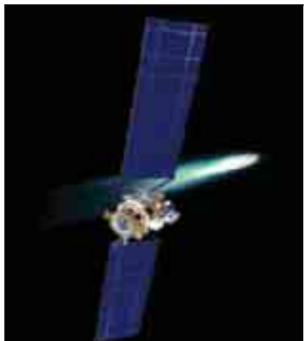
Artist's conception of the New Millennium Deep Space One Probe.