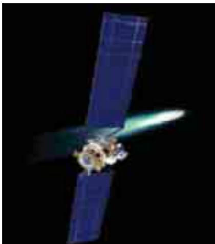
Artist's conception of the New Millennium Deep Space One Probe.