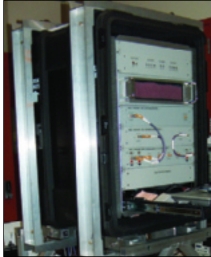
The TDS RF Design consists of a receiver rack drawer, a frequency synthesizer rack drawer, and an upconverter/downconverter.

The "sky-crane" concept developed for the 2009 Mars Science Laboratory (MSL) mission allows the delivery of much larger payloads than the previ-