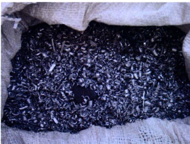
Figure 3: Aluminum chips for robot wheel.

After the completion of the robot's mechanical component design, a thorough investigation was performed on the availability of those components in the local market. The researchers had to rely on the reusable components wherever possible to imply. For example, aluminum chips collected from the lathe machine refusals were used to prepare the wheels of the robot. But because of the presence of too much slug, they did not appear to be a good choice for casting.