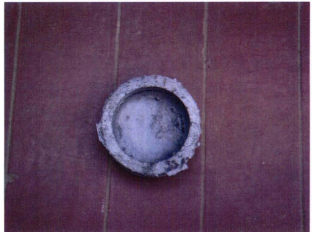
Figure 4: Robot wheel before finishing.

Then aluminum alloy automobile engine cylinders were melted and casted which showed very good performance for the casting. These cylinders were collected from the junkyards. Custom tires were prepared from heavy duty timing belts. This would help the robot to move about in a very rough terrain.