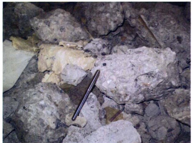
Figure 2: Comparison of the gravel size on site with a pen.

mostly populated cities in the world with the population density 14,608/km 2 [5]. With the population increase and urbanization, buildings are built for reasons, but in most cases without following proper guidelines and building codes. As a result, if a medium intensity of earthquake once strike Dhaka, the scenario will be disastrous. Keeping this fact in mind, a research work was carried out for the first time to make a machine help (hereinafter called rescue robot) for pro-disaster management and rescue purposes. The collapsed building site was investigated for getting the real life scenario after the disaster and also for the design purpose of the rescue robot to overcome all type of hindrance for rescue work.