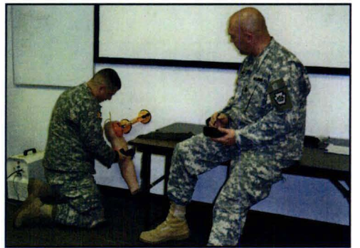
Figure 3: Instructor using the PDA.

Figure 2: HapMed PDA scenario control screen.