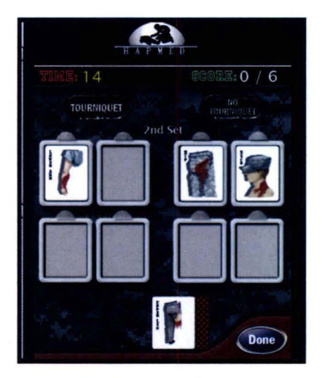
Figure 4: Card sort game-based training module screen.

enhance the training, each of the training modules sets the stage for the trainee through an advanced organizer, provides performance performance feedback, and concludes with a guided reflection exercise. The game-based instruction has, thus far, received the least attention in terms of validation work. We intend to evaluate the effectiveness of the game-based training format compared to more traditional methods for information presentation in future work.