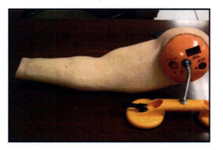
Figure 1: HapMed manikin arm prototype.

• If a tourniquet is loosened once having been applied, the "bleeding" will begin again (and the timer will start again).