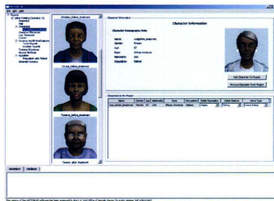
Figure 3: TEACH Scenario Editor

Previously, a VECTOR scenario editor component was developed to allow for the efficient creation of new game-based scenarios and to integrate instructional design principles into the authoring process to promote more effective training scenarios [8]. To address this concern, the VECTOR scenario authoring tools were augmented to support the unique requirements of TEACH, such as voice-acting and Face-FX processing.