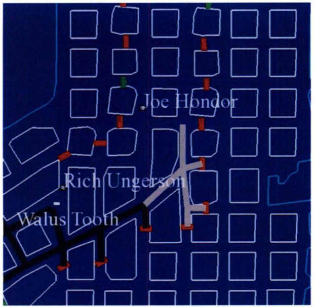
Figure 3: Miners Discover Smoke and Fire