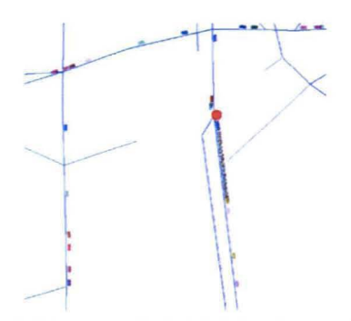
Figure 3: Shows an Avenue output network with an incident occurring on a road segment indicated by the large red dot.

Dynamicload is Cube's dynamic analog of the static PATHLOAD which is the heart of the macroscopic simulation, and takes as an input a list of volumes for each time segment as well as a path impedance (1). The path variable can be set to COST, TIME, or a list of working link variables (LW). LW variables can contain values of link impedance or impedance equations and can be set, then altered after each time segment in the ADJUST phase of Avenue. This provides a nice dynamic adjustment to the link impedance providing a more controlled environment to produce dynamic behavior in a simulated ITS event.