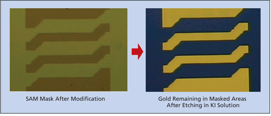
A Gold Layer Was Patterned by stamping it with a hexadecanethiol solution. The alkanethiolate SAM pattern thus formed was modified in a CF<sub>4</sub>/H<sub>2</sub> plasma, forming an etch mask. Then gold was etched away from the areas not masked.

areas of the gold against etching by a potassium iodide (KI) solution. This modification can be utilized, not only in the fabrication of single electronic devices but also in the fabrication of integrated circuits, microelectromechanical systems, and circuit boards.