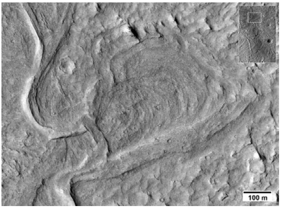
Figure 2. Sinuous ridge interpreted to be inverted topography of well-developed cut-off meander deposits [5]. Portion of HiRISE image PSP_006683_1740, 6.0S, 153.6E. Inset shows location within portion of the browse image.

One distinctive feature to come out of the mapping in western MFF is the common occurrence of many sinuous positive-relief ridges [5], which are particularly well exposed in portions of the lower member of MFF [6]. These sinuous ridges are interpreted to be inverted paleochannels [5-7] (Fig. 2), representing prolonged flow of a liquid perhaps coincident with the emplacement of the lower member of MFF [5-9].