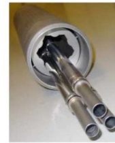
Reactor Simulator Heater Bundle Fabrication