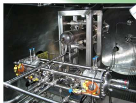
2 kWe Stirling Power Conversion