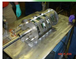
Annular Linear Induction Pump