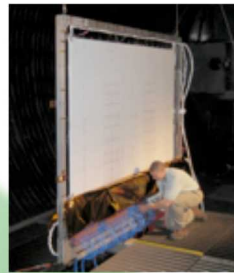
Radiator Panel Demonstration