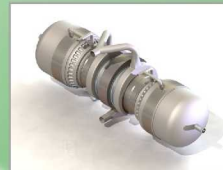
Power Conversion Design