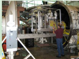
2 kWe Brayton Power Conversion