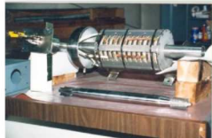
Liquid Metal Pump