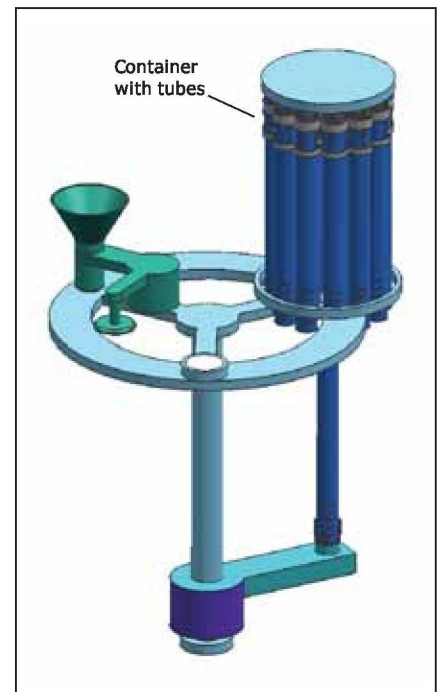
Figure 2: Containerization System includes loading, heating/sealing, and storage stations.