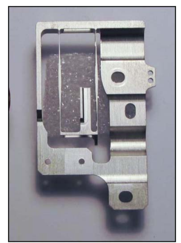
Figure 4: Micro-milled and passivated shutter structure.

A new manufacturing approach was selected and the shutter mechanical part was optimized for micromilling instead of EDM machining. Through the application of dedicated cutting parameters, the generation of heat in the device was effectively reduced. Due to a lower the power consumption the spring constant was designed to 39 N/m.