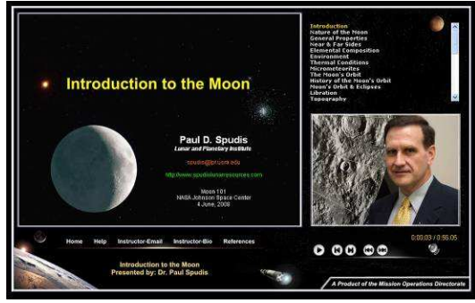
Fig. 3: Typical customized lesson from Microsoft Producer.

associated slides. Also provided are links to the home page, help page, instructor's e-mail, references, and with selected lessons, instructor biography.