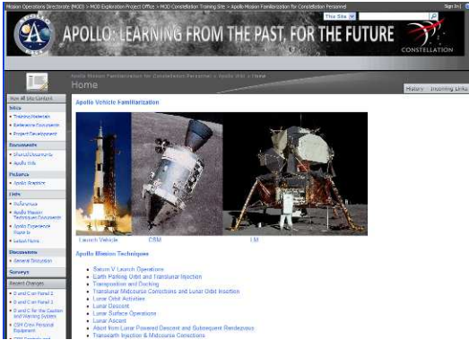
Fig. 5: Apollo Wiki main page

Figure 6 shows the main wiki page for the Command & Service Module (CSM). Topics include Guidance and Control, Reaction Control System, Docking and Transfer, and Failure Modes and Failure History. Similar pages exist for the Saturn and the Lunar Module vehicles, and each page may have several further subtopic links.