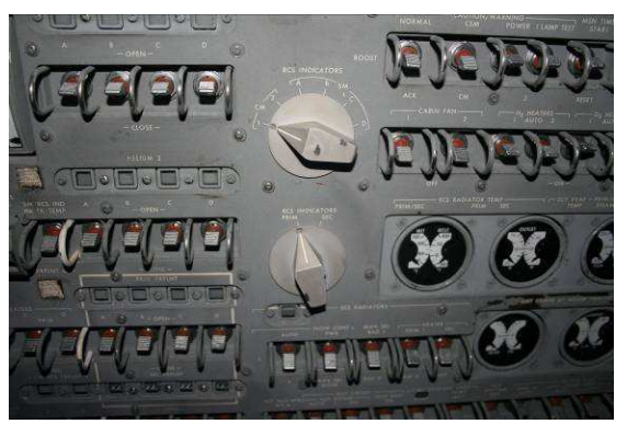
Fig. 2: Typical Kansas Cosmosphere, showing panel O2 in the Apollo 13 Command Module Odyssey .

In other cases, personal photographs found on the Internet were desired. The copyright owners were contacted and all were cooperative, permitting NASA to use their work for Governmental purposes without the payment of a license fee, provided their copyright notice was included beside the image and included a statement that its use was with their permission.