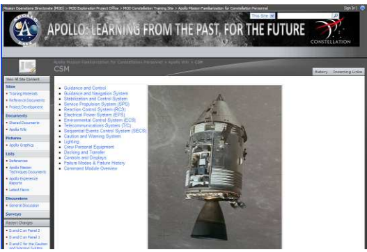
Fig. 6: Apollo Wiki, CSM subsection

Figure 6 shows the main wiki page for the Command & Service Module (CSM). Topics include Guidance and Control, Reaction Control System, Docking and Transfer, and Failure Modes and Failure History. Similar pages exist for the Saturn and the Lunar Module vehicles, and each page may have several further subtopic links.