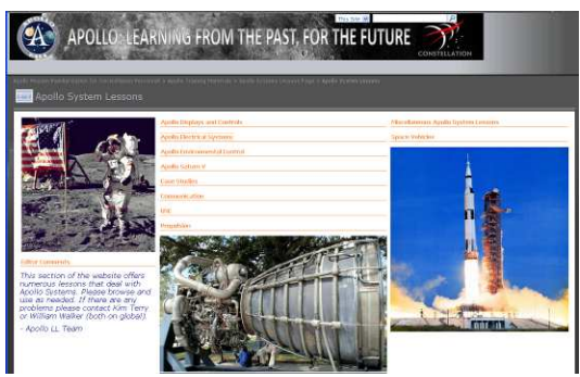
Fig. 7: Apollo Systems Lessons page

From the main Apollo Training Materials page, the user may select the Apollo Systems Lessons page, as seen in Figure 7. This page has links to the various video/PowerPoint lessons on topics such as Displays & Controls, Electrical, ECLSS, Saturn V, Case Studies, Comm, GNC, and Propulsion.