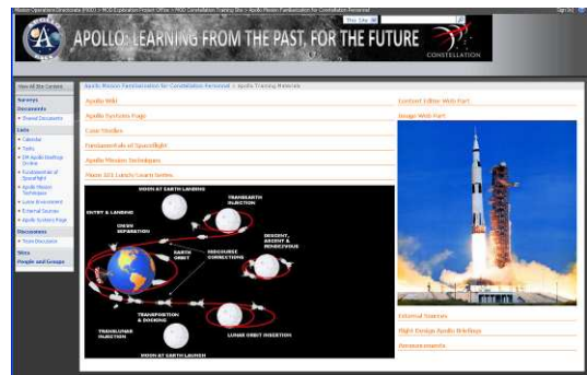
Fig. 4: Apollo Training Materials page

The Apollo Wiki, as seen in Figure 5, contains links to the following sections: