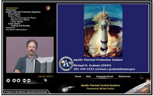
Fig. 8: Sample lesson

The distance-learning lessons are in the form of a recorded briefing by an instructor and the accompanying PowerPoint slides, as seen in Figure 8.