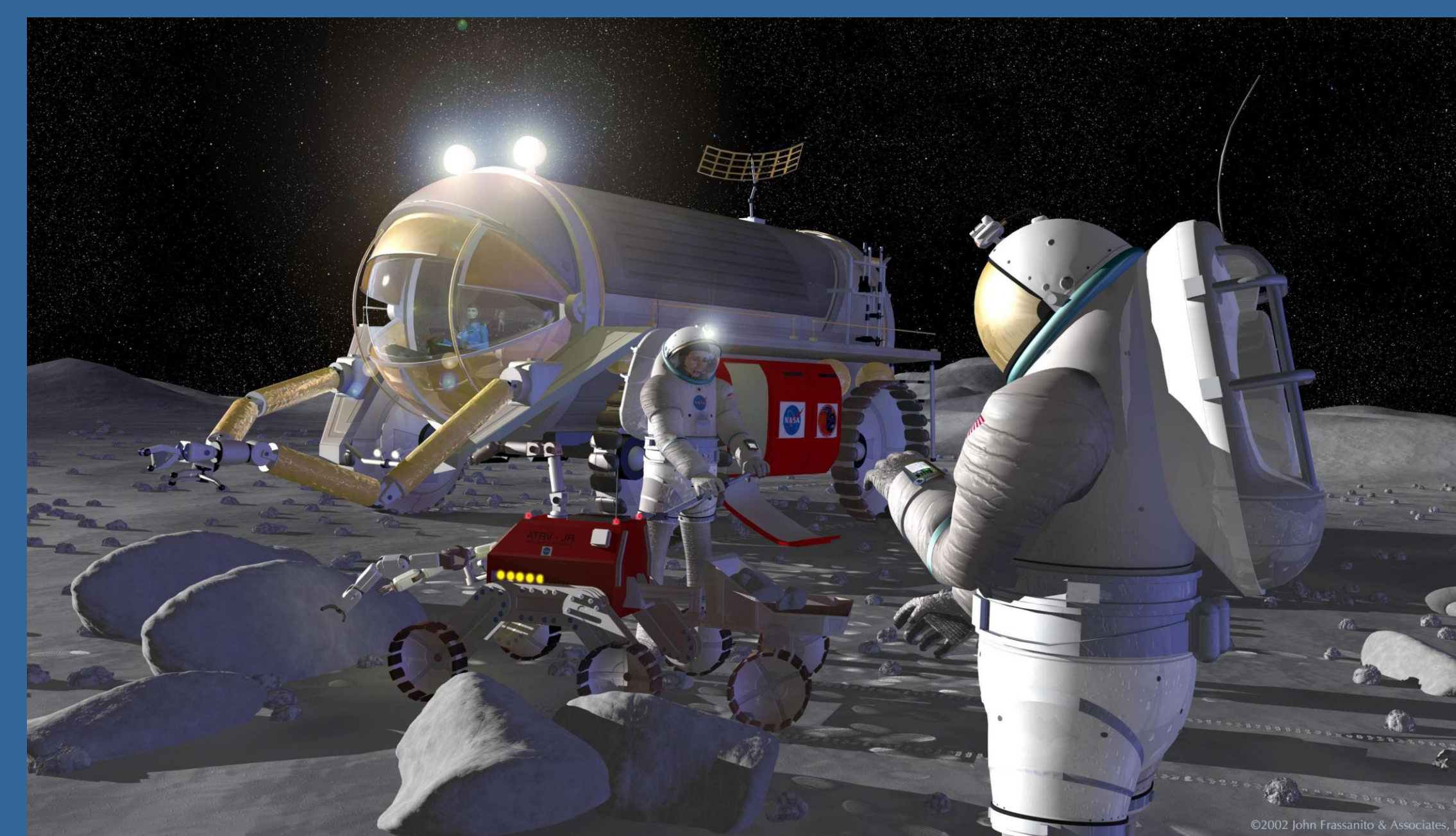
Artist's Concept of Manned Exploration Mission, NASA