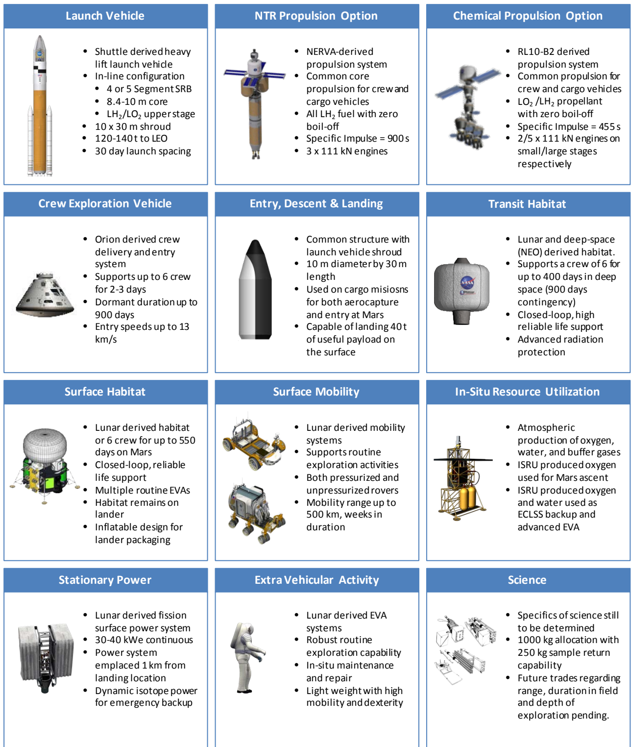
Figure 3 – Transportation and Surface Systems Concepts