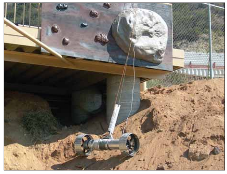
Figure 1. A Prototype Axel Rover can operate in a free or tethered configuration. Testing of this version is complicated by a need to properly wrap the power cable around the axle housing. It has been proposed to eliminate the power cable and install rechargeable batteries in a future version.