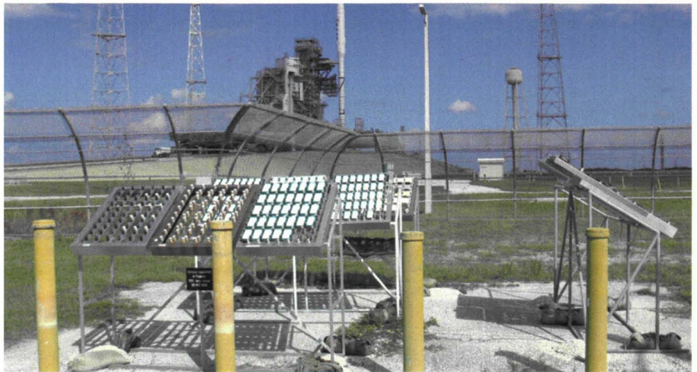
Life Cycle Corrosion Test Site near Pad 39B with Ares 1-X on-site

The Lead-Free Technology Experiment in Space Environment (LTESE) experiment, led by MSFC, is a small active package containing test boards and a data acquisition system. It was launched November 16, 2009, on STS 129, and installed on the outside of the International Space Station. The plan is to record the resistance of each circuit and temperature in the box at periodic intervals. The desired time frame for exposure to a space environ-