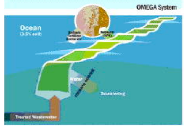
Fig. 1: Schematic representation of OMEGA system