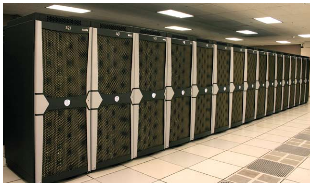
Shown here is one row of cabinets that make up the 100-cabinet Pleiades supercomputer system at Ames Research Center. In 2010, Pleiades ranked as one of the fastest systems on the Top 500 list of the world's most powerful supercomputers.

3DGeo's work with Ames started with its Internet Seismic Processing (INSP) product. As a provider of advanced imaging software services for the oil and gas