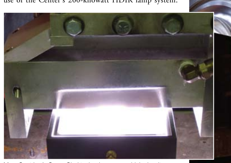
MesoCoat Inc.'s CermaClad technology uses a high-density infrared arc lamp (above) to bond the cladding material to metal surfaces, preventing corrosion for up to 100 years. While this technology extends the lifespan of infrastructure like steel beams and pipes, the company's ZComP 844 TBC extends the life of gas turbine engine components (right) and hardly adds any cost to normal maintenance cycles.

ZComP 844TM and CermaCladTM are trademarks of MesoCoat Inc.