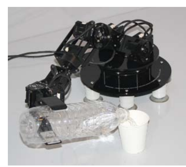
Energid Technologies Corporation's NASA SBIR-derived Actin software provides control of robot manipulators like this Robai Cyton model.

NASA has repeatedly turned to complex robotics for solutions to extend human presence deep into space at reduced risk and cost and to enhance space operations in low Earth orbit. At Johnson Space Center, engineers