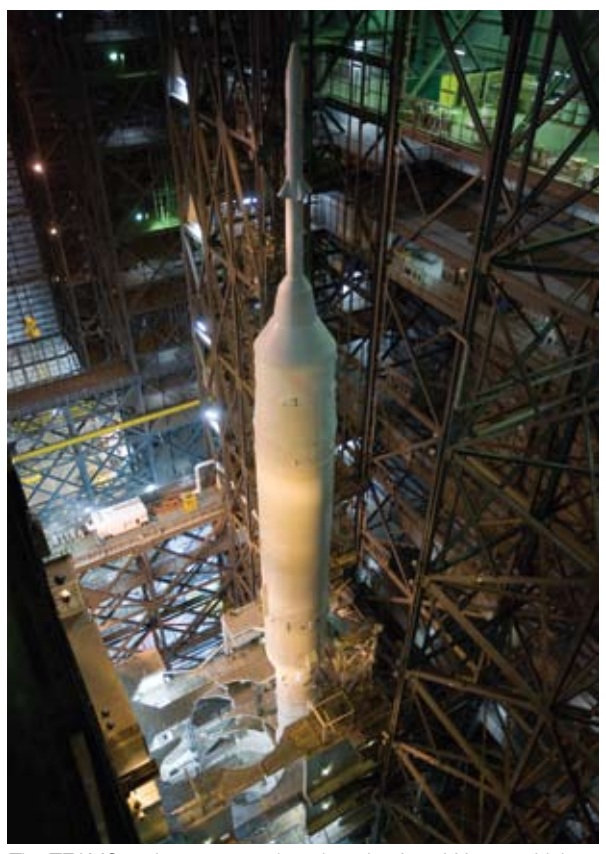
The TEAMS toolset was employed on the Ares I-X test vehicle, shown here at Kennedy Space Center's vehicle assembly building. TEAMS is also applicable to transportation systems, medical equipment, factory systems, telecommunications, and refinery systems.

First featured in Spinoff 2001, today the toolset includes TEAMS-Designer, a program that creates a