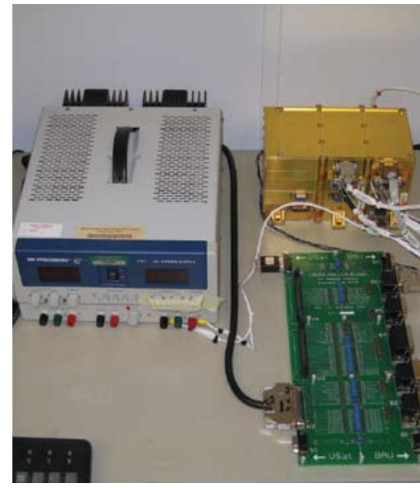
The Hammers Company Inc.'s (tHC Inc.) VirtualSat systems supported spacecraft flight software development and testing, as well as spacecraft environmental testing and checkout, at the Jet Propulsion Laboratory for NASA's Time History of Events and Macroscale Interactions during Substorms (THEMIS) mission.

to use ITOS independently. "We train users to make their own database in just a short period, and then they are off and running. A knowledge base is formed from instructions the operators make. Then ITOS will manage the commands, point the antenna, receive the telemetry, process the telemetry, send messages, and perform health and safety monitoring—all without human operators," says Hammers.