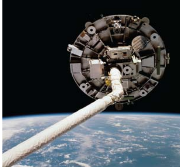
Before being released by Space Shuttle Endeavour during the STS-69 mission in 1995, the Wake Shield Facility (WSF) lingers above Earth.

Throughout the 1990s, the WSF flew on three space shuttle missions as a series of proof-of-concept missions. These experiments are a lasting testament to the success of the shuttle program and resulted in the development of the first thin film materials made in the vacuum of space,